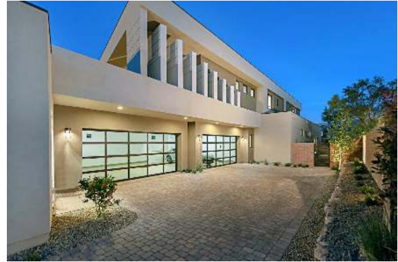
The Four-Car Side Loaded Garage