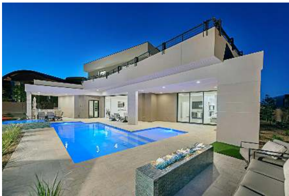
The Resort-Like Rear Yard