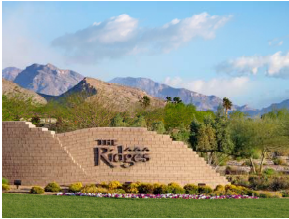
An Entry Monument at The Ridges